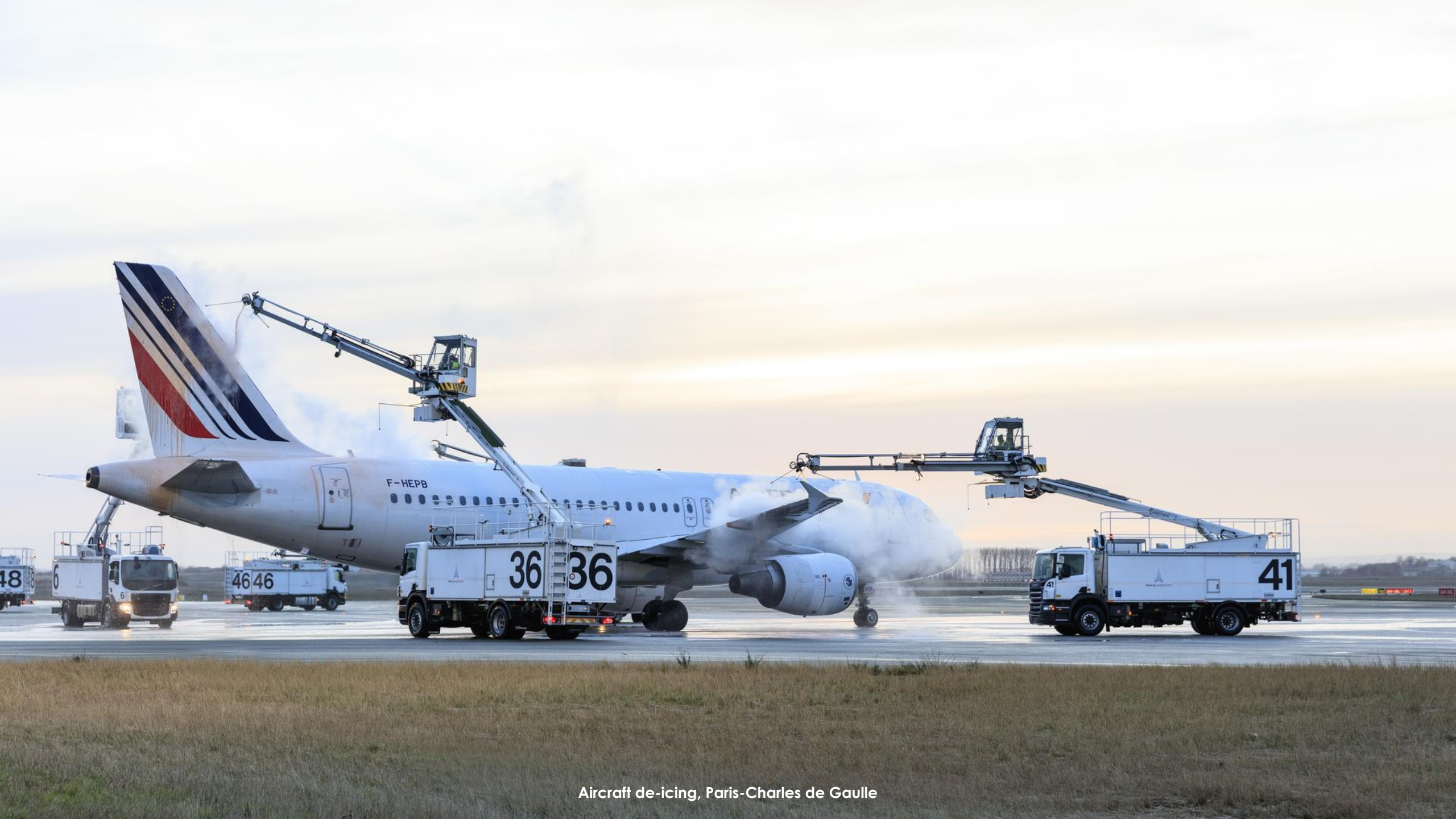
Aircraft de-icing, Paris-Charles de Gaulle