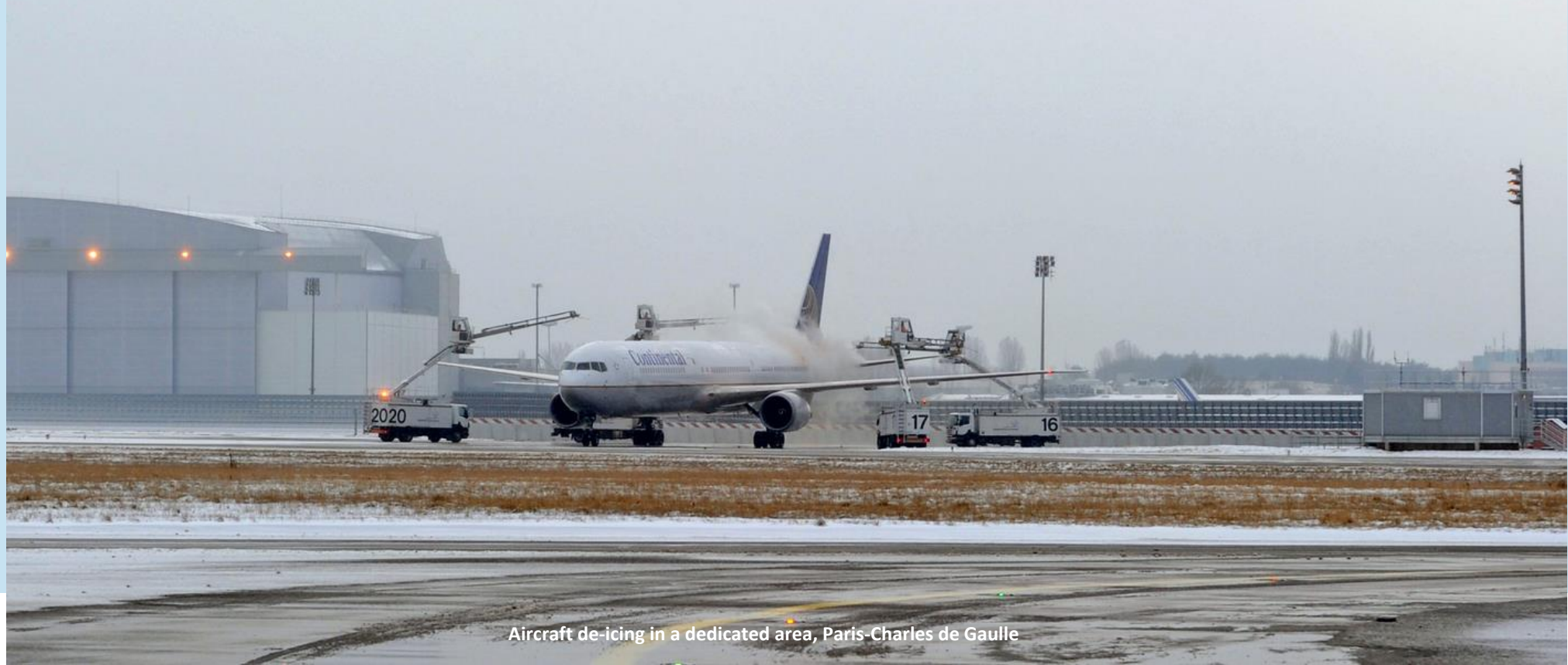
Aircraft de-icing in a dedicated area, Paris-Charles de Gaulle