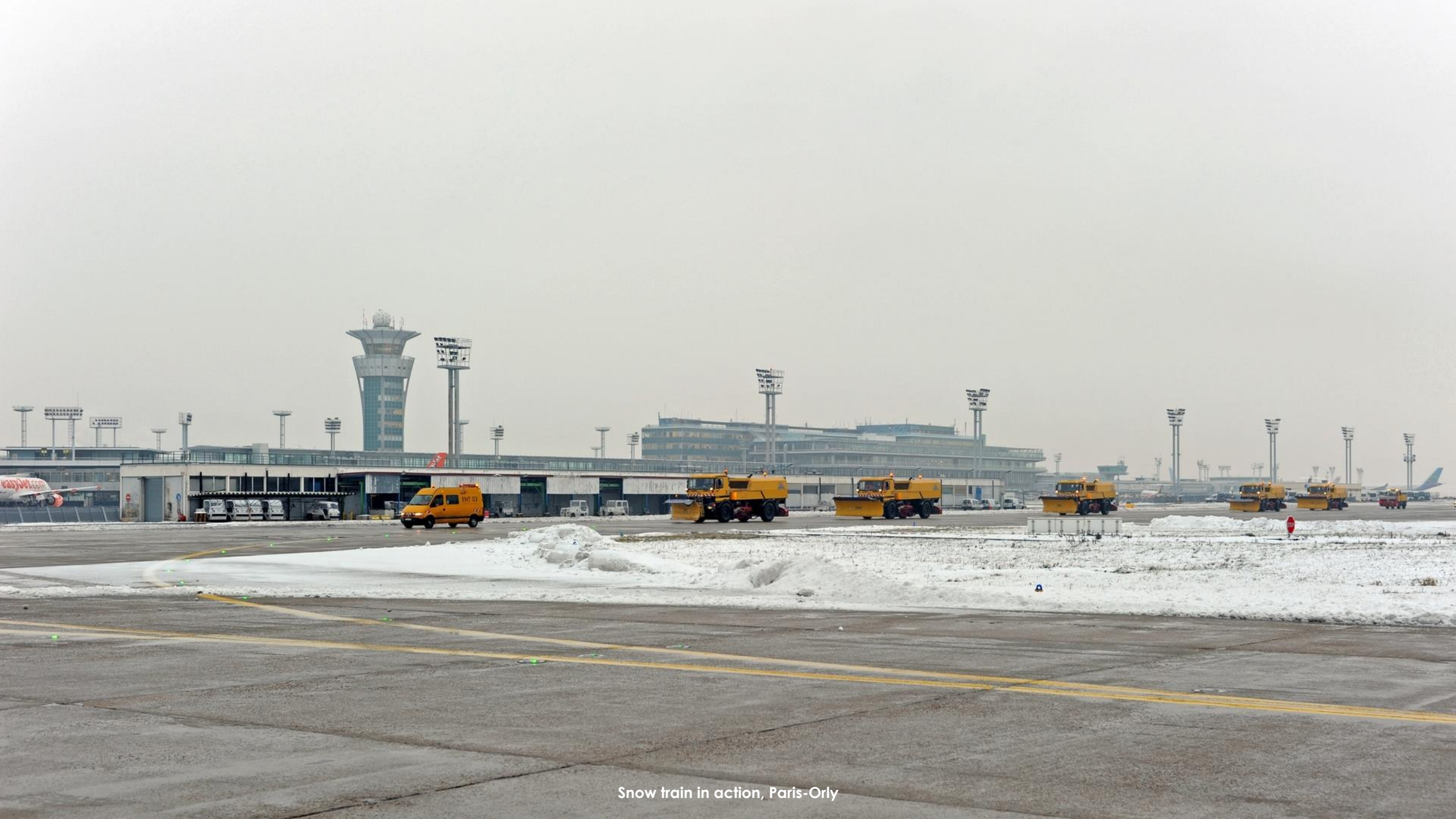
Snow train in action, Paris-Orly