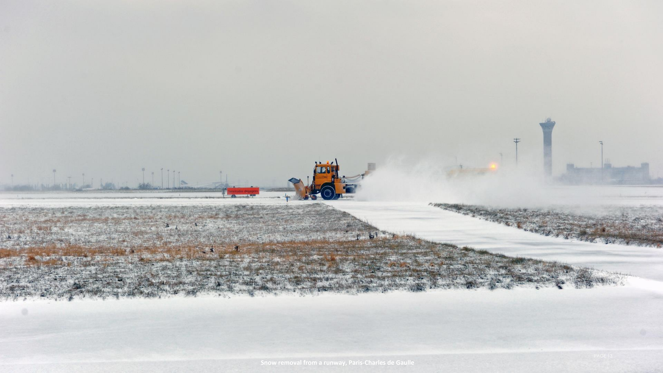
Snow removal from a runway, Paris-Charles de Gaulle