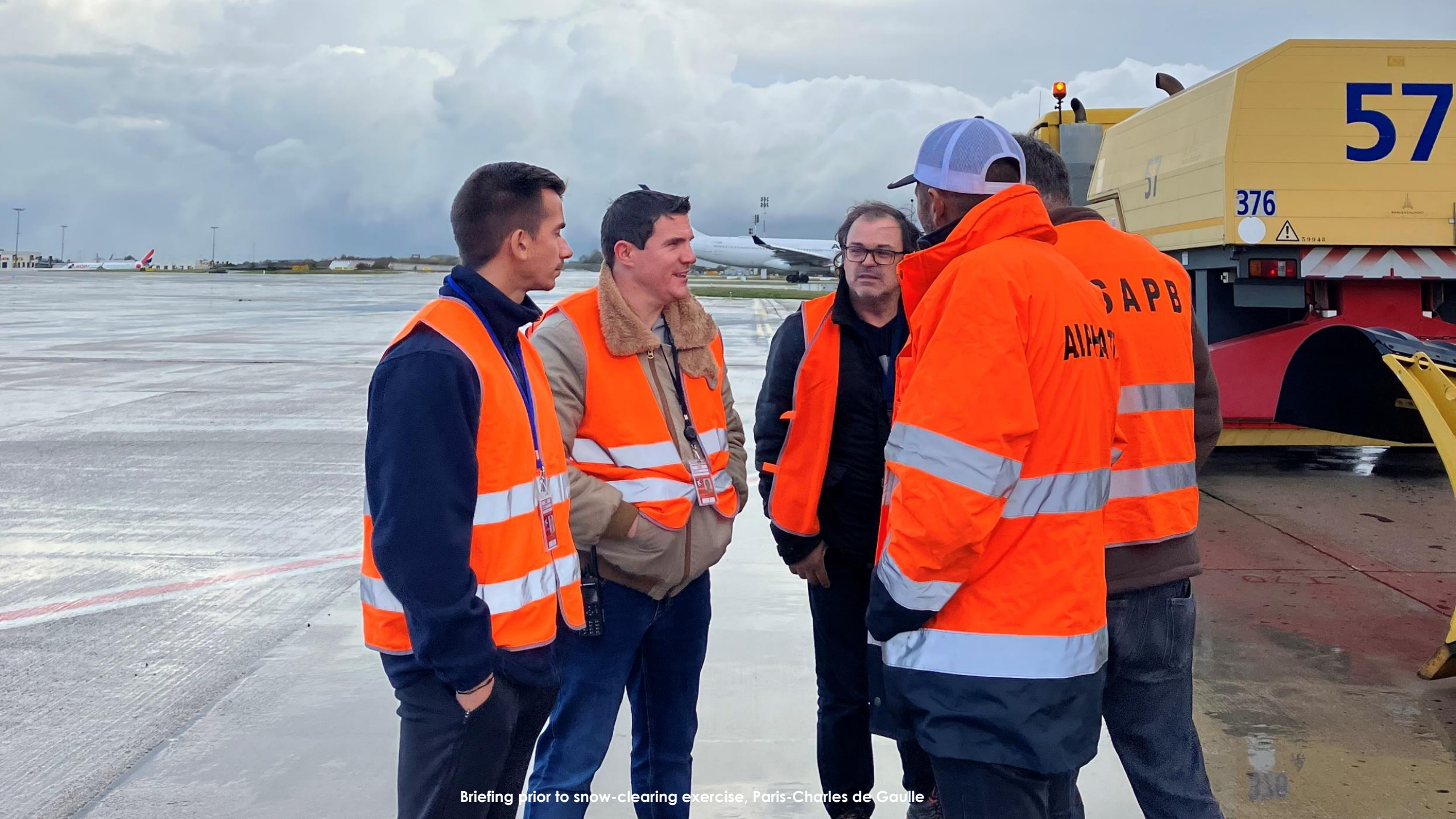
Briefing prior to snow-clearing exercise, Paris-Charles de Gaulle