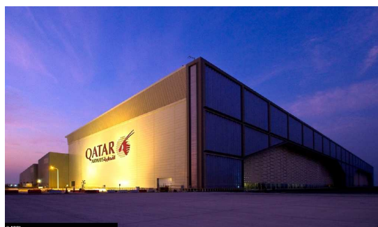
Qatar Airways Maintenance Centre

Futhermore, ADPI assisted Bechtel Group (in charge of works supervision) during the construction supervision phase and managed the reconfiguration of Qatari airspace, which handles about 360,000 aircraft movements per year.