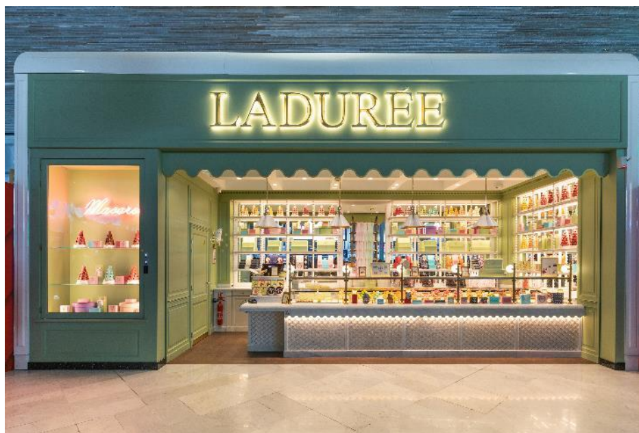
Boutique Maison Ladurée @Ladurée

Maison Ladurée opens its second exclusive “Le Macaron” outlet, dedicated to this iconic sweet treat. Passengers can discover the widest variety of macaron recipes with over 30 different flavours, including lavender, red berries, peach, chocolate, and even Earl Grey, the smoky recipe of which was especially created for the airport.