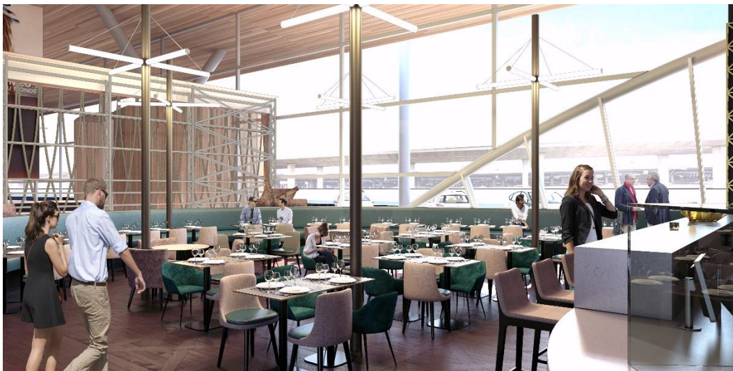
View of Café Eiffel - Terminal 2 - Paris-Charles de Gaulle airport

"Gustave Eiffel always made useful things. He brought people together to work on designs that served the greatest number. We kept this in mind when creating Café Eiffel, and its small exhibition on the great man himself. We wanted to remind world travellers that behind the Tower is a man, Gustave Eiffel, and that he brought joy and pride to the French people", explains Philippe Coupérie-Eiffel.