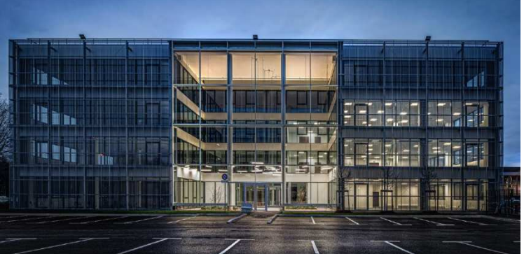
Offices building