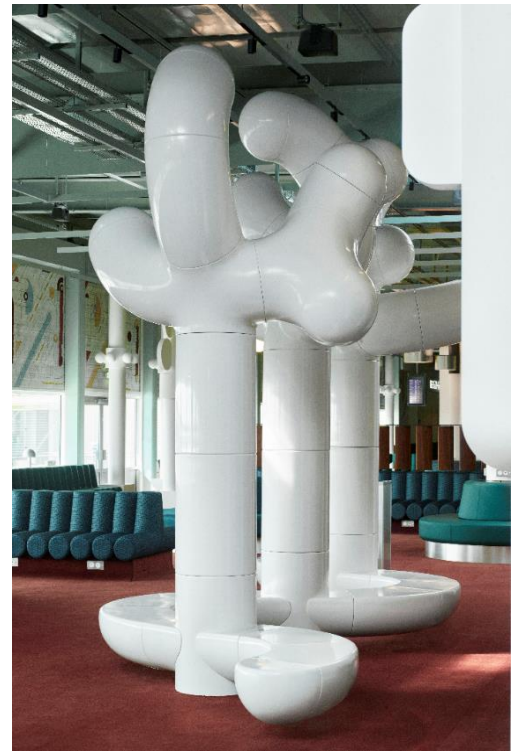
Terminal 2G at Paris-CDG . " A l'ombre des arbres ": the masterful sculpture of the Simonnets

At the invitation of Gilbert Kann, curator of decorative arts furniture, it welcomes travelers from all over the world thanks to a clever assembly of modules that the artists designed and made in their Parisian workshop. Since 1970, the year they graduated from the Ecole des Beaux-Arts in Paris, this couple of sculptors have been working and living together and devoting themselves exclusively to the creation and production of plastic works.