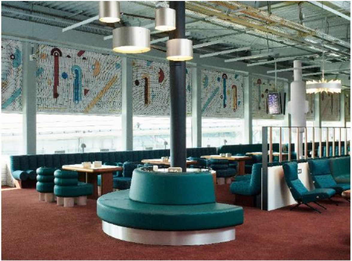
The new boarding hall in Terminal 2G is now in the pure tradition of French furniture and decorative arts