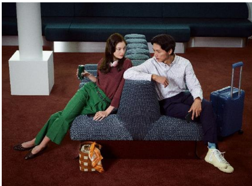
Terminal 2G at Roissy - The Extime brand intervenes at the moment when the passenger reconnects to the journey ahead

In Terminal 2G, Extime, invited by Paris Aéroport, offers a unique Parisian experience , providing a local touch to travellers from all over the world.