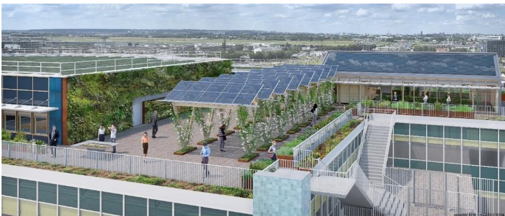
Transformation of level 6 at Orly 4 incorporating a new high-energy performance façade

Conceived as a hanging garden, this project prefigures the environmental renewal of Paris-Orly.